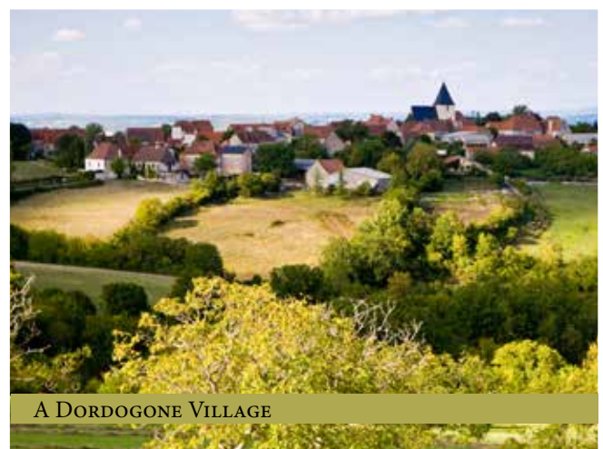
A DORDOGONE VILLAGE